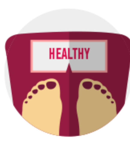
Reaching a healthy weight